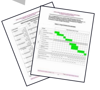
Security Management Schedule & Budget